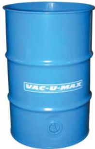
55-gallon open-top steel drum