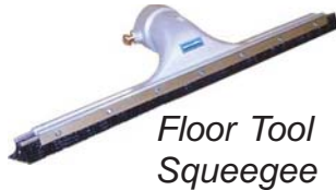
Floor Tool Squeegee